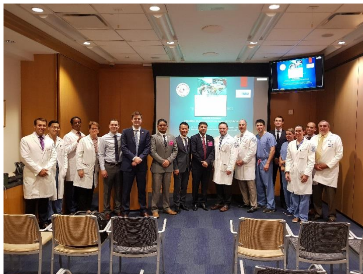
With the HSS surgeons for the traveling fellows presentation