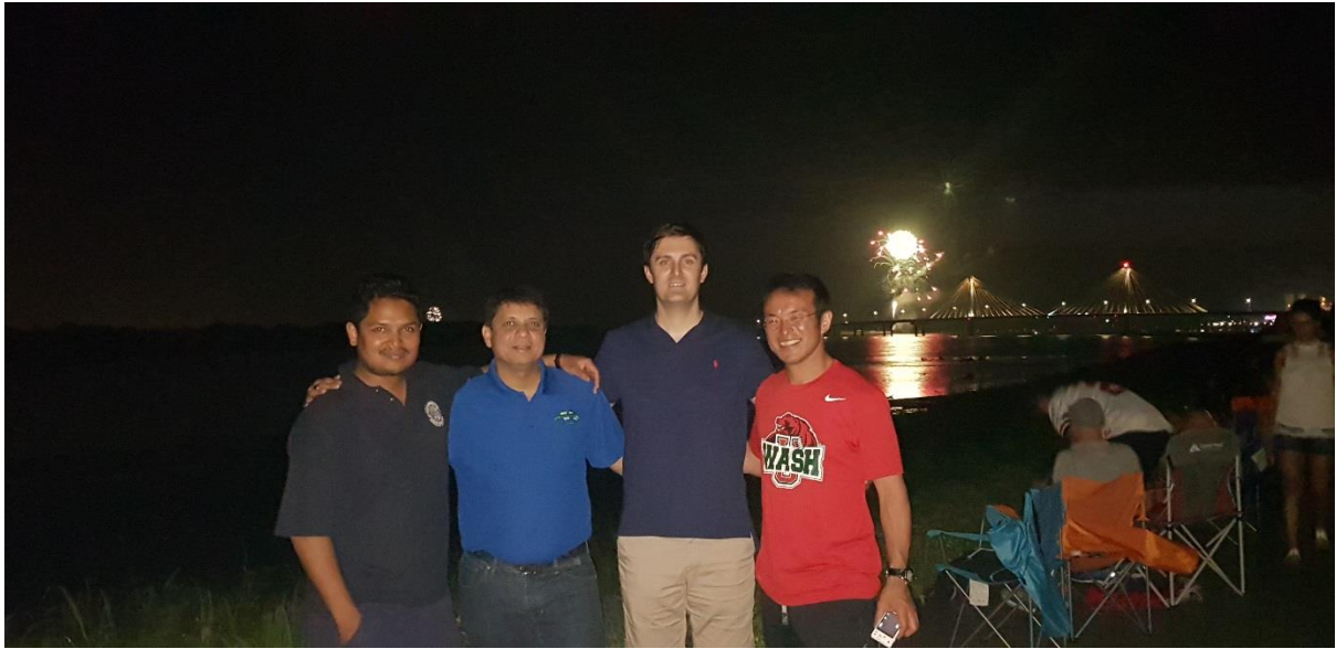
4 th of July fireworks in Alton, Illinois overlooking the Mississippi river