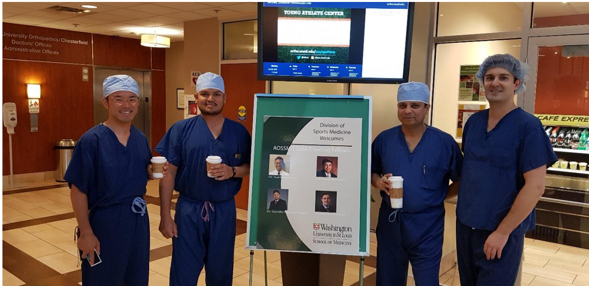
A lovely sign awaited us in Chesterfield Orthopaedic Clinic