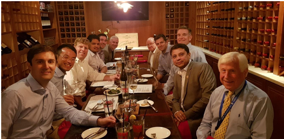
At the Chop House Restaurant for the world's biggest baked potato!