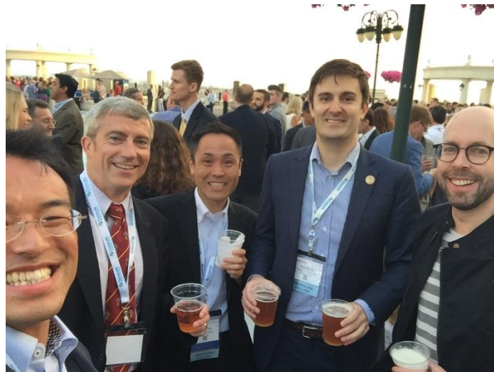
Lovely reception at the pool deck