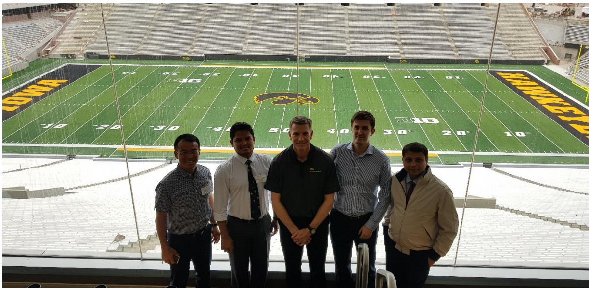
University of Iowa Football stadium (part of the "Big 10")