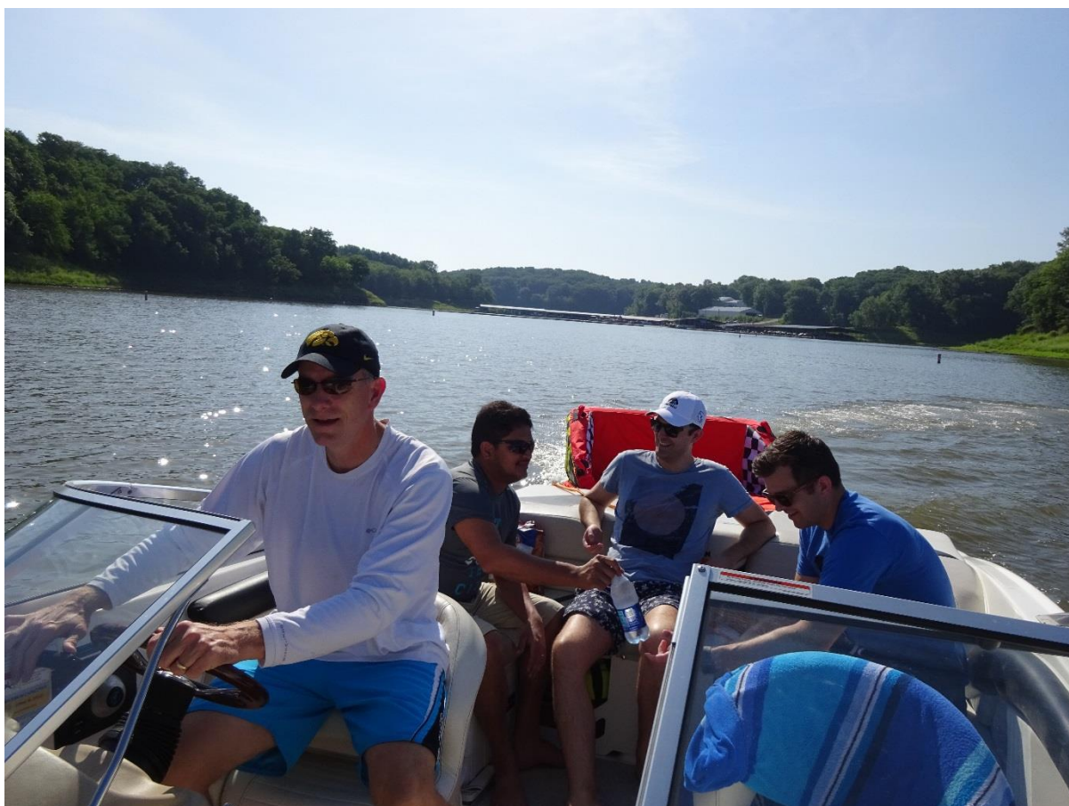
On the “Wolf boat”