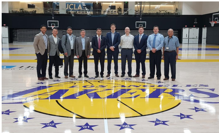
15 th June